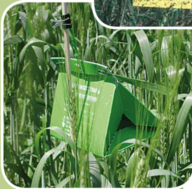
Figure 13. Sex pheromone trap used to monitor for adult wheat midge. (Knodel, Department of Entomology, NDSU)