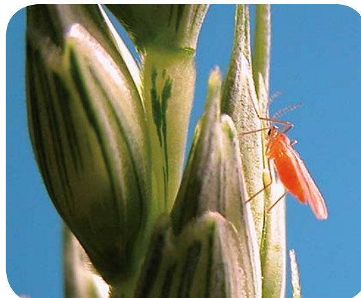
Figure 1. Adult wheat midge. (Extension Entomology, NDSU)

long with three pairs of long legs. It has a pair of wings, which are oval, transparent and fringed with fine hairs. Two eyes are conspicuous and black.