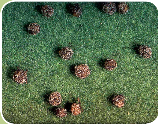
Figure 4. Cocoon of wheat midge. (Saskatoon Research Centre, Canada)