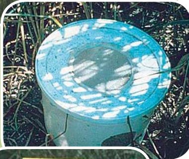
Figure 11. Emergence trap used to monitor for adult wheat midge.