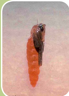
Figure 5. Pupa of wheat midge.