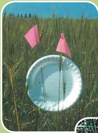
Figure 10. White plastic foam plate (trap) used to monitor for adult wheat midge.