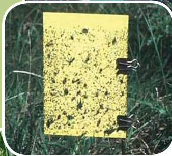
Figure 12. Yellow sticky trap used to monitor for adult wheat midge.