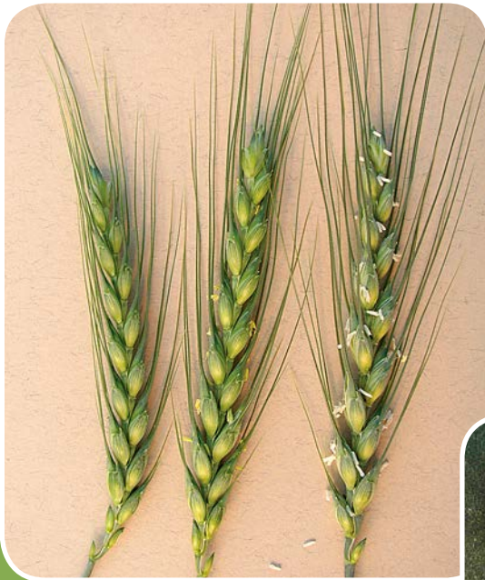
Figure 7. Crop stages of hard red spring wheat – heading (left), early flowering (center) and late flowering (right).

Based on North Dakota field observations, wheat midge larval infestations were the greatest when heading occurred during peak female emergence (1,475 degree days). Wheat midge degree days (DD) are based on