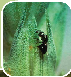
Figure 14. Parasitoid, Macroglenes penetrans , of wheat midge. (Saskatoon Research Centre, Canada)