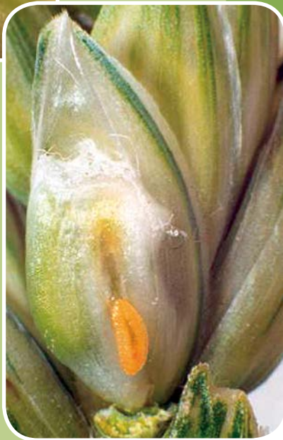
Figure 3. Larva of wheat midge in wheat kernel.