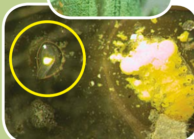
Figure 15. Dissected parasitoid larva (circled) that was developing inside the wheat midge larva. (Anderson, Department of Entomology, NDSU)