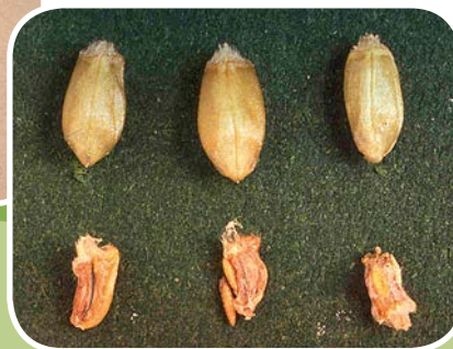
Figure 8. Comparison of healthy (top) and damaged (bottom) wheat kernels from wheat midge feeding injury. (Saskatoon Research Centre, Canada)

Although DD are useful in predicting development of many insect species, these predictions are only estimates. The accuracy of a DD estimate is dependent on the temperatures used in calculating DD. Degree days