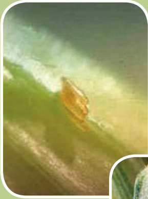
Figure 2. Egg of wheat midge. (Saskatoon Research Centre, Canada)