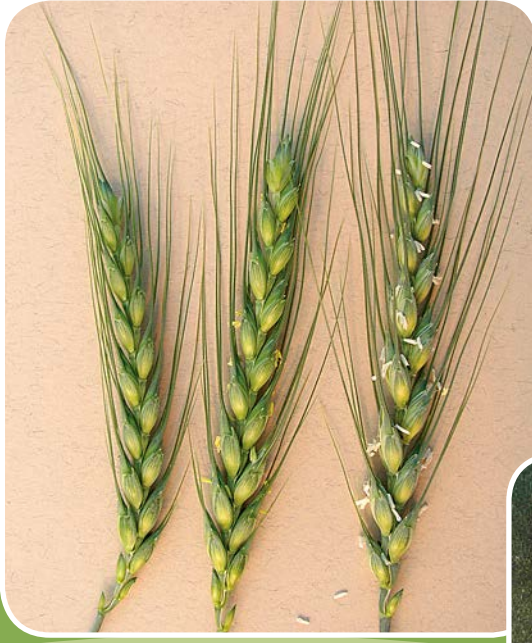
Figure 7. Crop stages of hard red spring wheat – heading (left), early flowering (center) and late flowering (right).

Based on North Dakota field observations, wheat midge larval infestations were the greatest when heading occurred during peak female emergence (1,475 degree days). Wheat midge degree days (DD) are based on