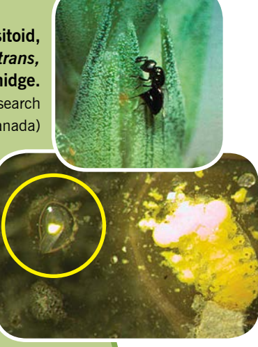
Figure 15. Dissected parasitoid larva (circled) that was developing inside the wheat midge larva.