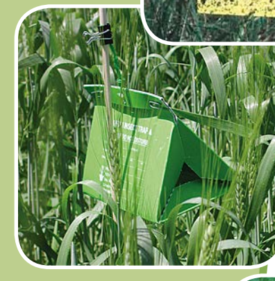
Figure 13. Sex pheromone trap used to monitor for adult wheat midge. (Knodel, Department of Entomology, NDSU)