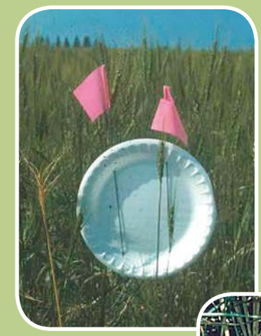
Figure 10. White plastic foam plate (trap) used to monitor for adult wheat midge.