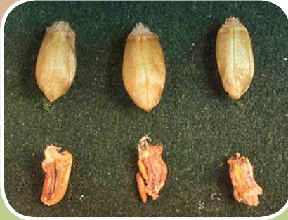
Figure 8. Comparison of healthy (top) and damaged (bottom) wheat kernels from wheat midge feeding injury. (Saskatoon Research Centre, Canada)

Although DD are useful in predicting development of many insect species, these predictions are only estimates. The accuracy of a DD estimate is dependent on the temperatures used in calculating DD. Degree days