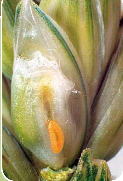
Figure 3. Larva of wheat midge in wheat kernel. (Saskatoon Research Centre, Canada)

Figure 2. Egg of wheat midge. (Saskatoon Research Centre, Canada)