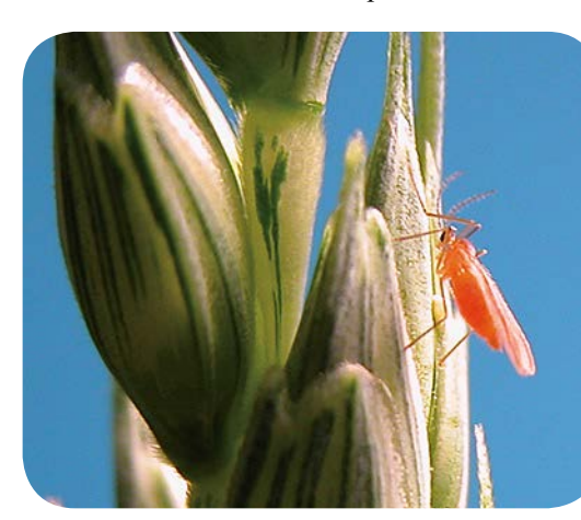
Figure 1. Adult wheat midge. (Extension Entomology, NDSU)

NDSU EXTENSION SERVICE North Dakota State University Fargo, North Dakota