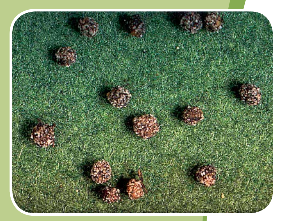
Figure 4. Cocoon of wheat midge.